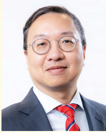
林定國資深大律師 Mr Paul Lam Ting-kwok, SC