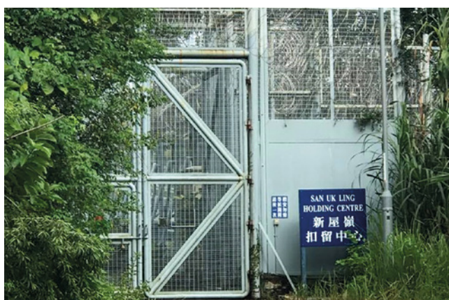
監警會委員赴新屋嶺扣留中心視察。 IPCC Members visited San Uk Ling Holding Centre.

Six incident days were identified including 9 June 2019, 12 June 2019, 1 July 2019, 21 July 2019 (Yuen Long Incident), 11 August 2019 (Kwai Fong Station and Tai Koo Station Incident) and 31 August 2019 (Prince Edward Station Incident) (Chapters 7 to 12) because of the number of complaints clustered around and the public concern expressed on them. In addition, the Study also included two other topics of public interest including Police identification during POEs (Chapter 13), as well as detention arrangement at San Uk Ling Holding Centre (Chapter 14).