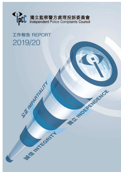
IPCC Report 2019/20 《監警會 2019/20 工作報告》