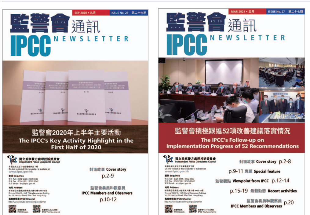
IPCC Newsletters 《監警會通訊》