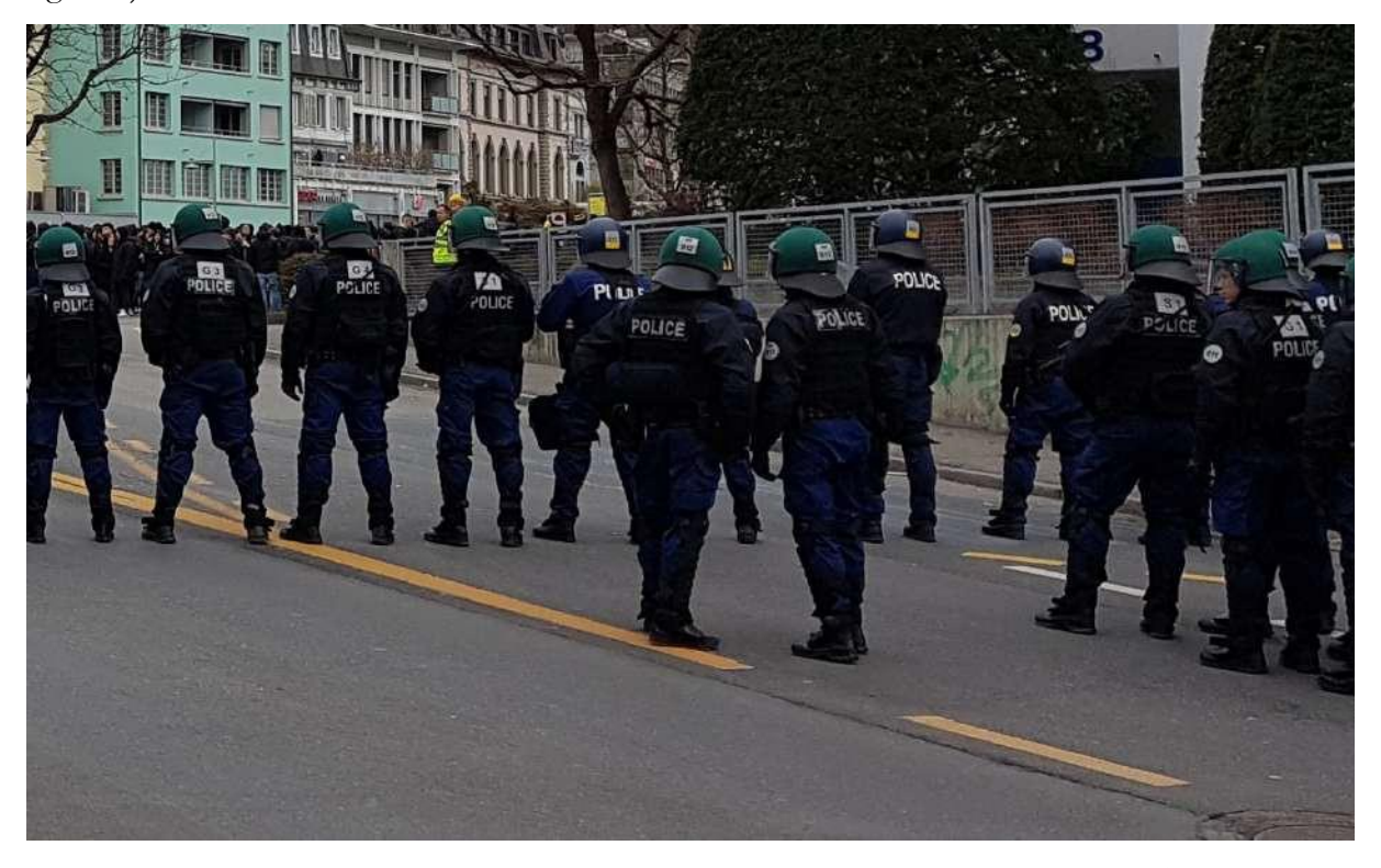
Figure 6: public order police officers of the Cantonal Police of Bern and their group assignment on the back of the helmet and of the uniform (in grey).

The relevant group numbers are visible on the back of their vest and on the back of their helmet (see figure 3).