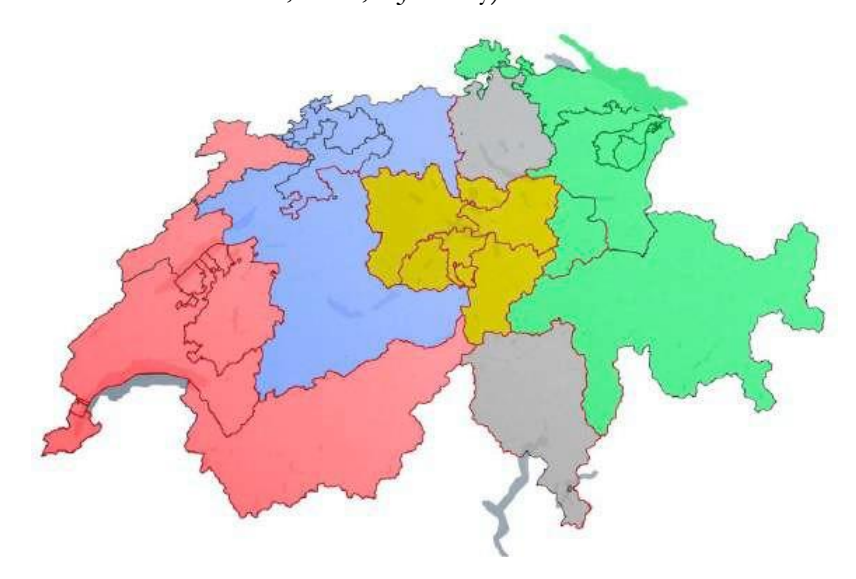
Figure 4: The four Swiss police concordats and their member

The local police corps (city police or cantonal police) is generally responsible for police operations related to demonstrations or protests ("territorial sovereignty"). For larger operations in particular, units from the relevant police concordats can be called in. There are four different concordats (agreements between cantons) for intercantonal cooperation (Konferenz der Kantonalen Polizeikommandanten, 2019, 1 January).