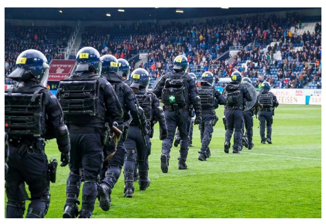
Figure 7: public order police officers of the Cantonal Police Lucerne and their group assignment in yellow on the back of the helmet

According to the information provided by the Cantonal Police of Lucerne, all police forces deployed in Lucerne must be identifiable. There are no requirements regarding colour or positioning. In Lucerne, identification is ensured by a visible ID number on the back of the helmet at the start of operations. Each member of a group (each group consisting of four police officers) is assigned a number. Due to the different functions within the group and the number, it is possible to identify the relevant police officer.