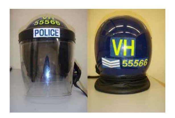
Figure 1: NATO style helmets with clear identifier codes for each individual officer.

for the officer's numbers. All these should be in yellow, with a dark blue background. The pictures below, copied from the Module G3 manual, show how these markings should look.