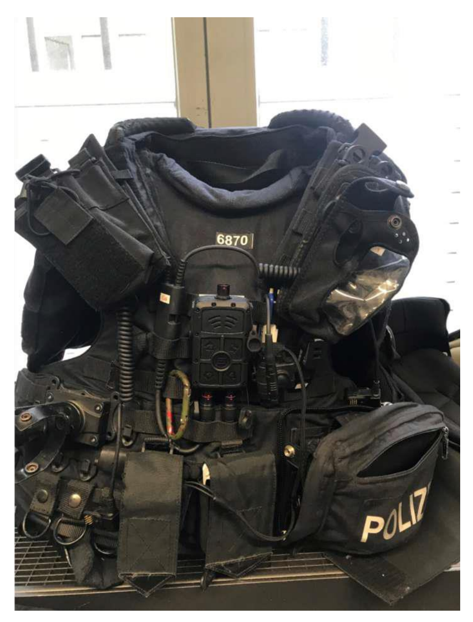
Figure 9: The positioning and size of the personal ID number on the public order vest of the Zürich City Police. (© Andreas Moschin, Stadtpolizei Zürich).

The list with the assignment is checked accordingly by the platoon leader. According to the information provided by the Zürich City Police, there is no exception where the police officers could resign from wearing their personal ID number. This whole principle has been in use for round about eight years. The demand for the identification of police officers originally came from left-wing circles at the political level, with specific reference to the constitutional law. For complaints about the police