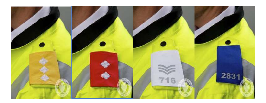
Figure 3: Coding schemes signifying differing command levels operable during public order events.

officers from multiple force areas. Below are some examples, yellow denoting a 'Bronze' commander, red a 'PSU Inspector', white a PSU 'Sergeant' and blue 'Police Constable'68