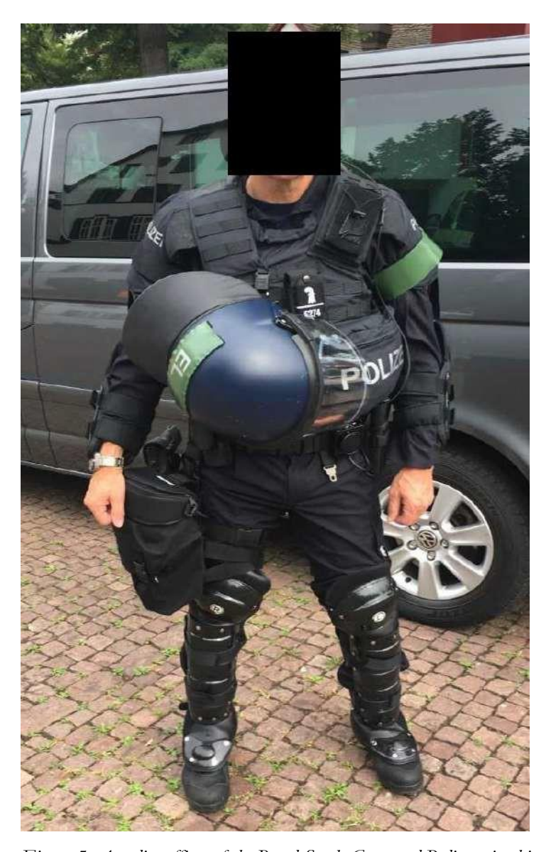
Figure 5: A police officer of the Basel-Stadt Cantonal Police — in this case the head of operations — with his public order uniform and the necessary individual identification at chest level (directly above the helmet).

This regulation applies to all ranks, including the head of operations. Excluded from the regulation are members of the special units (Art. 9 para. 3 PolV). The control of the correct wearing of the personal ID number is a management task and is usually taken over by the group leader. There is no independent inspection regime for the monitoring of police operations of the Cantonal Police of Basel-Stadt. Like all the other involved cantons, the Canton Basel-Stadt has an ombudsman who receives complaints regarding police actions or operations. In case of a complaint, the ombudsman