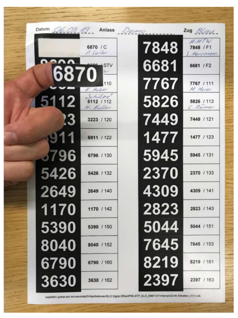
Figure 8: The assignment of the numbers of each police officer at the Zürich City Police.

The number is affixed on the chest of each police officers public order uniform (see figure 6).